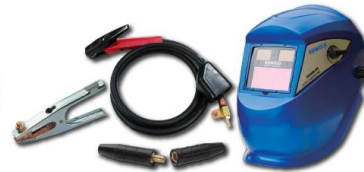
Electric / Gas cutting