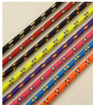
Nylon, Manila and PP ropes