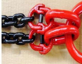
Wire | Chain slings